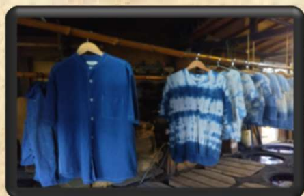
Noguchi dyeing factory