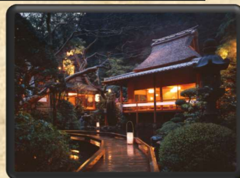
Ukai Toriyama elegant architecture and fine dining