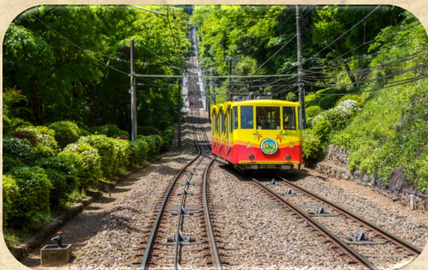
Mount Takao Cable car surrounded by lush greenery