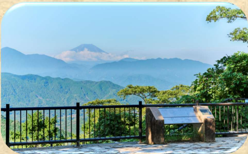
Mount Fuji spectacular views from Mount Takao's peak