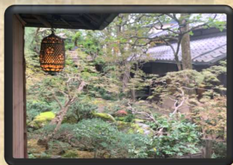
Dokurakuan Tea Estate