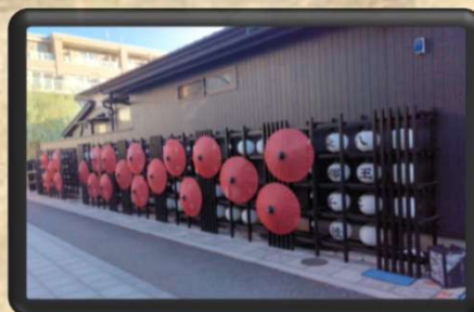
Souto Terrace Commercial Center