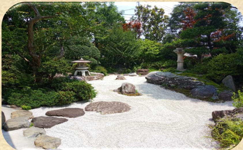
Serenity of Komagino Rock Garden