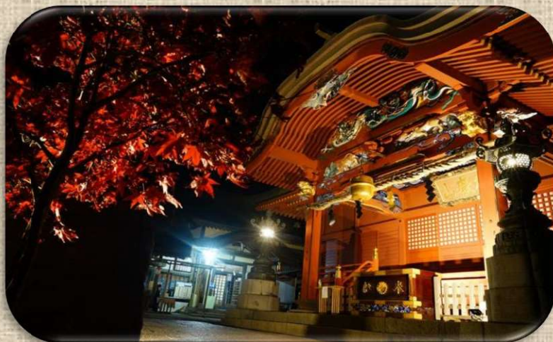
Magical Musashi Mitake Shrine illuminated in autumn foliage