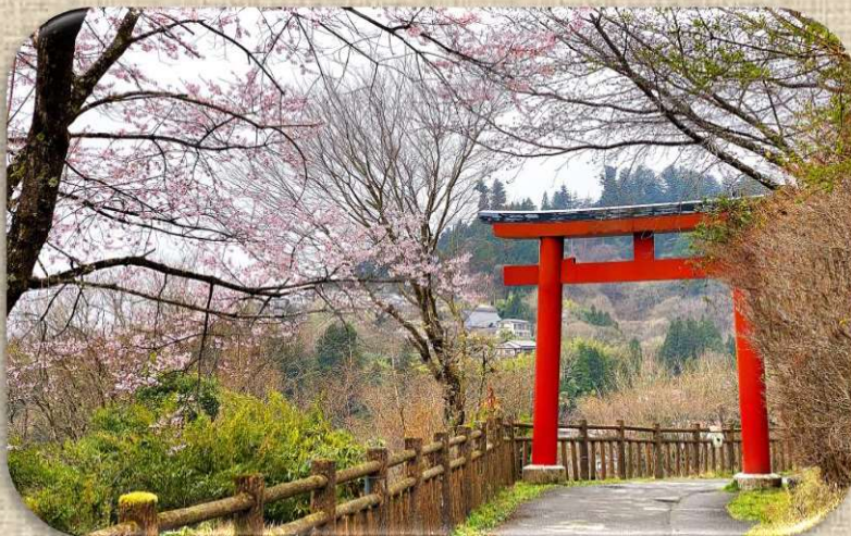
Second chance to experience cherry blossom in mid-April