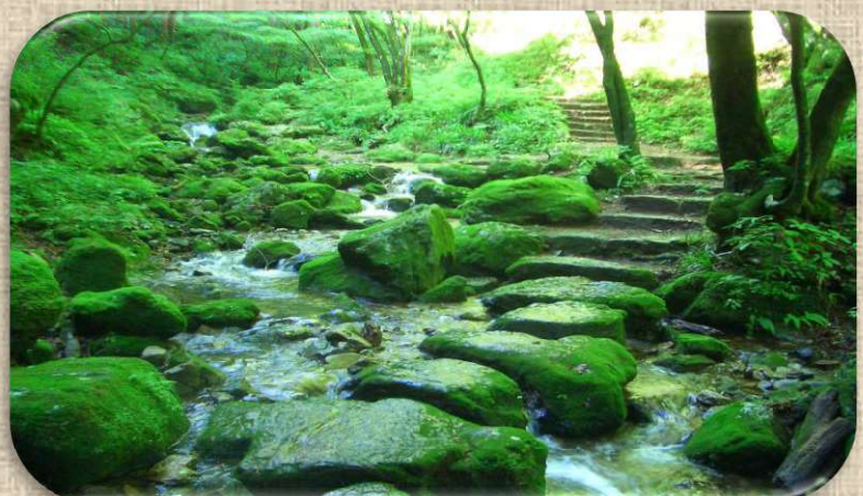
Cedar paths with waterfalls, sacred spots, and unique flora and fauna

*HIGH-VALUE DESTINATION, EASILY REACHED VIA KEIO SERVICES, STILL UNKNOWN TO THE MAINSTREAM TRAVELERS. DISCOVER IT SOONER THAN LATER.