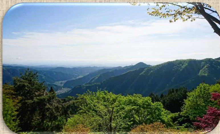
Panoramic views from the cable car arrival point.